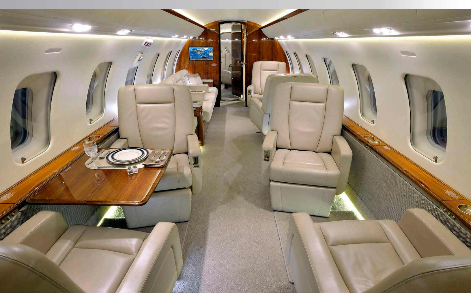
Foward cabin looking aft