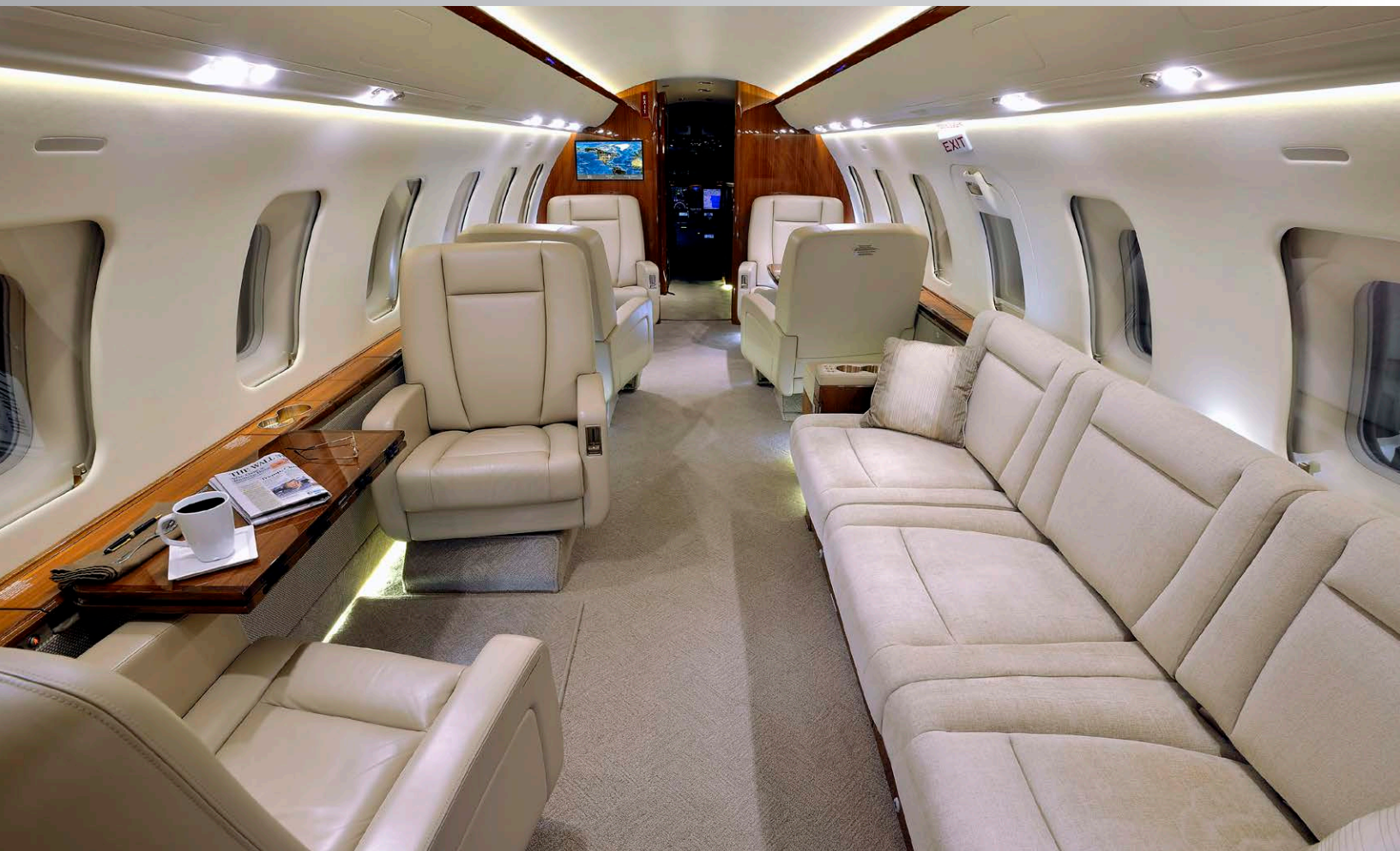
Aft cabin looking forward