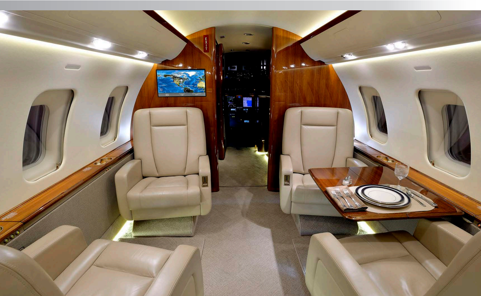
Forward cabin looking forward