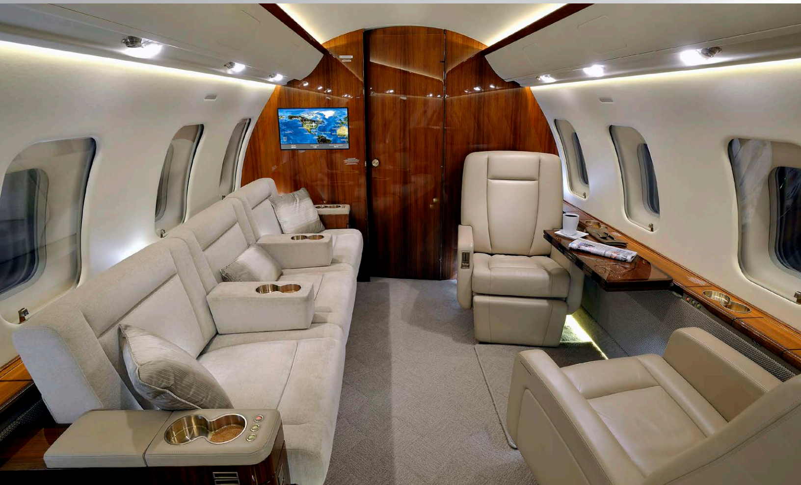
Aft cabin looking aft