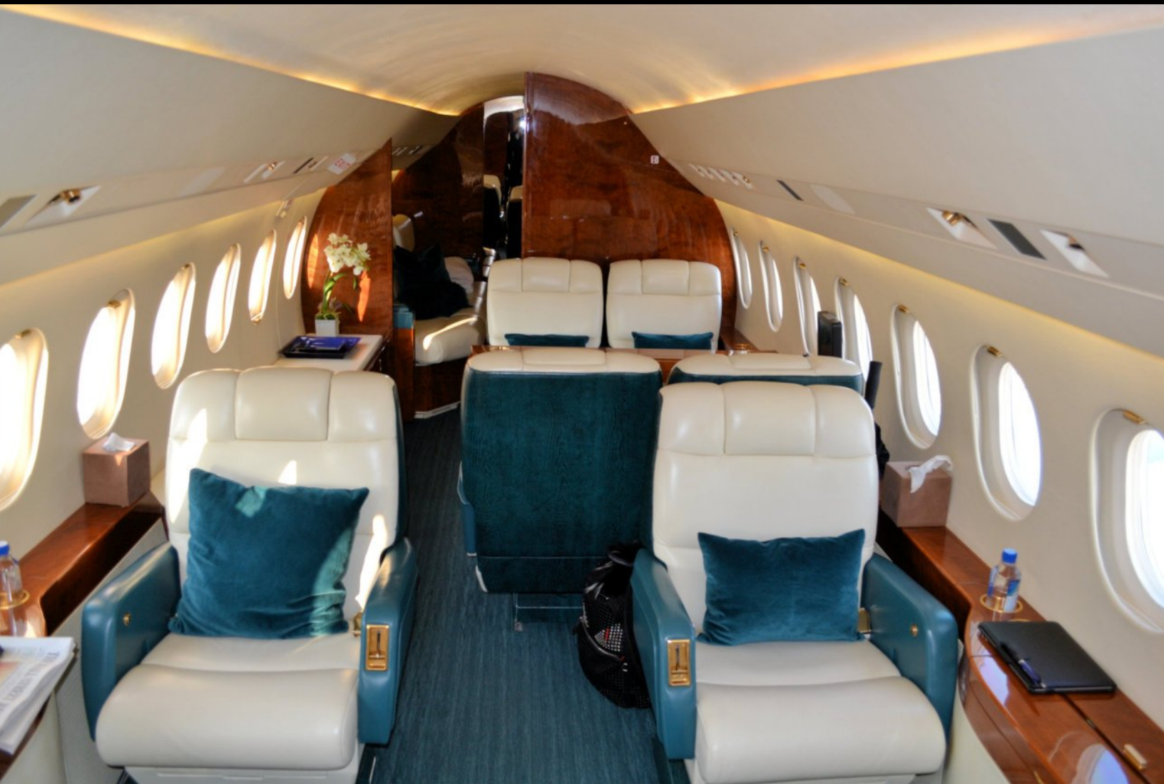
Mid cabin conference