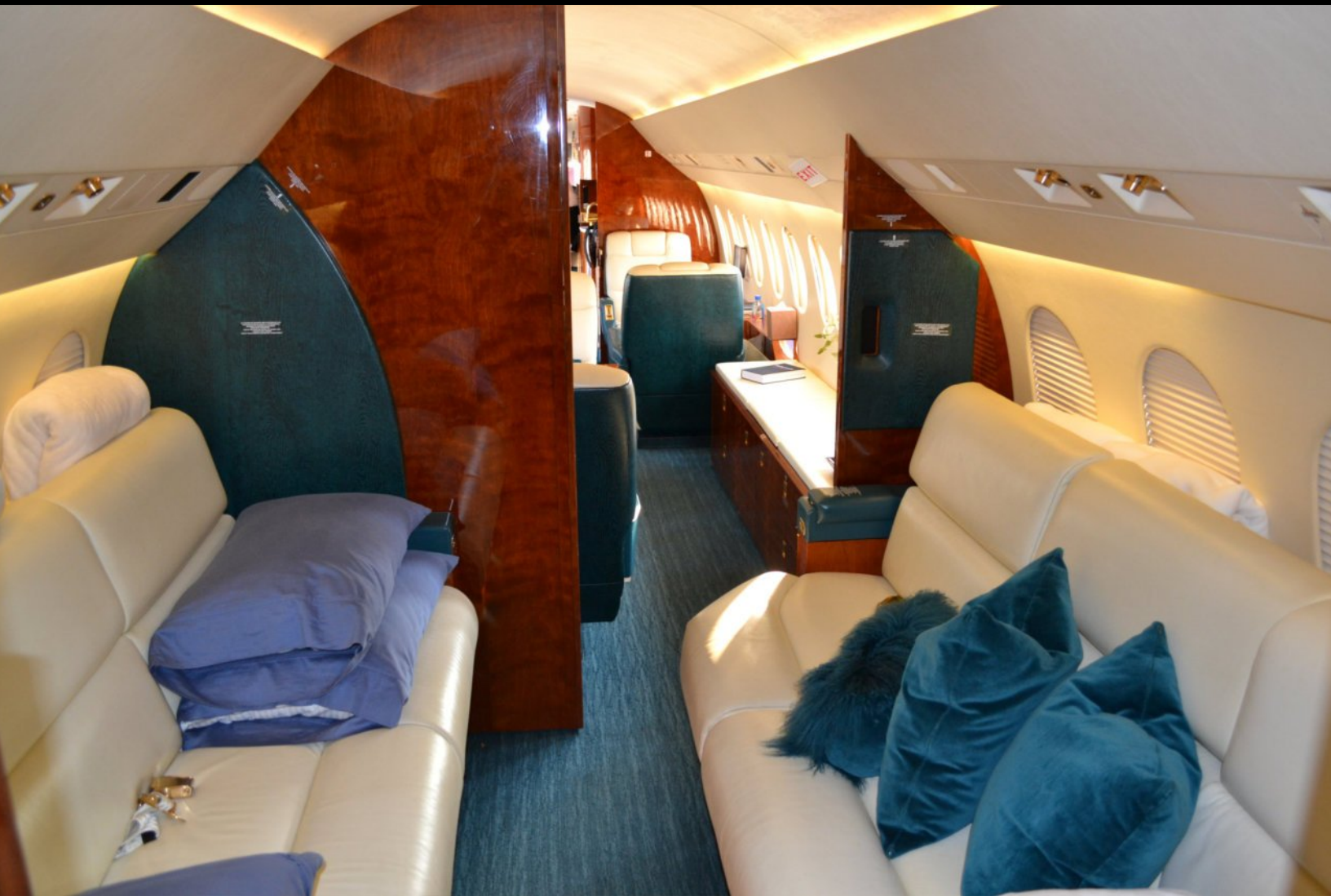
Aft sleeping compartment