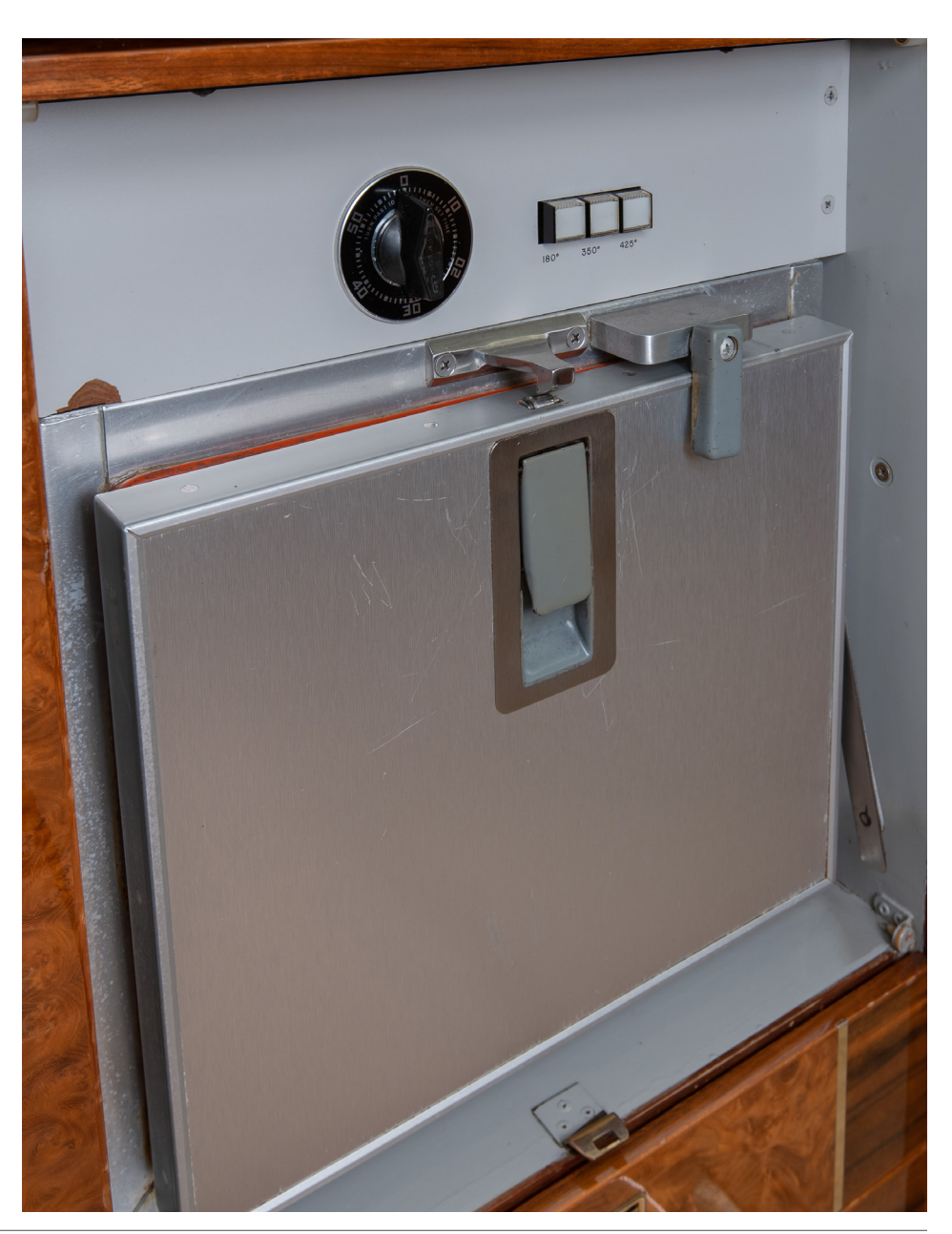
SPECIFICATIONS ARE PROVIDED FOR INFORMATIONAL PURPOSES ONLY AND DO NOT CONSTITUTE REPRESENTATIONS OR WARRANTIES. THESE SPECIFICATIONS ARE SUBJECT TO BUYER'S INDEPENDENT VERIFICATION UPON INSPECTION. THE AIRCRAFT IS SUBJECT TO PRIOR SALE, LEASE AND/OR REMOVAL FROM THE MARKET WITHOUT PRIOR NOTICE. MARCH 8, 2021 1:54 PM