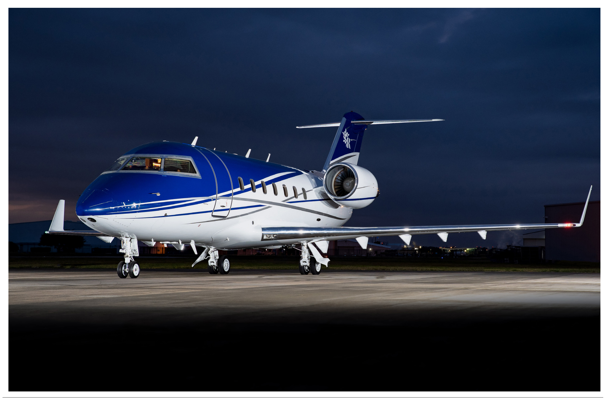
SPECIFICATIONS ARE PROVIDED FOR INFORMATIONAL PURPOSES ONLY AND DO NOT CONSTITUTE REPRESENTATIONS OR WARRANTIES. THESE SPECIFICATIONS ARE SUBJECT TO BUYER'S INDEPENDENT VERIFICATION UPON INSPECTION THE AIRCRAFT IS SUBJECT TO PRIOR SALE, LEASE AND/OR REMOVAL FROM THE MARKET WITHOUT PRIOR NOTICE. MARCH 8, 2021 1:54 PM