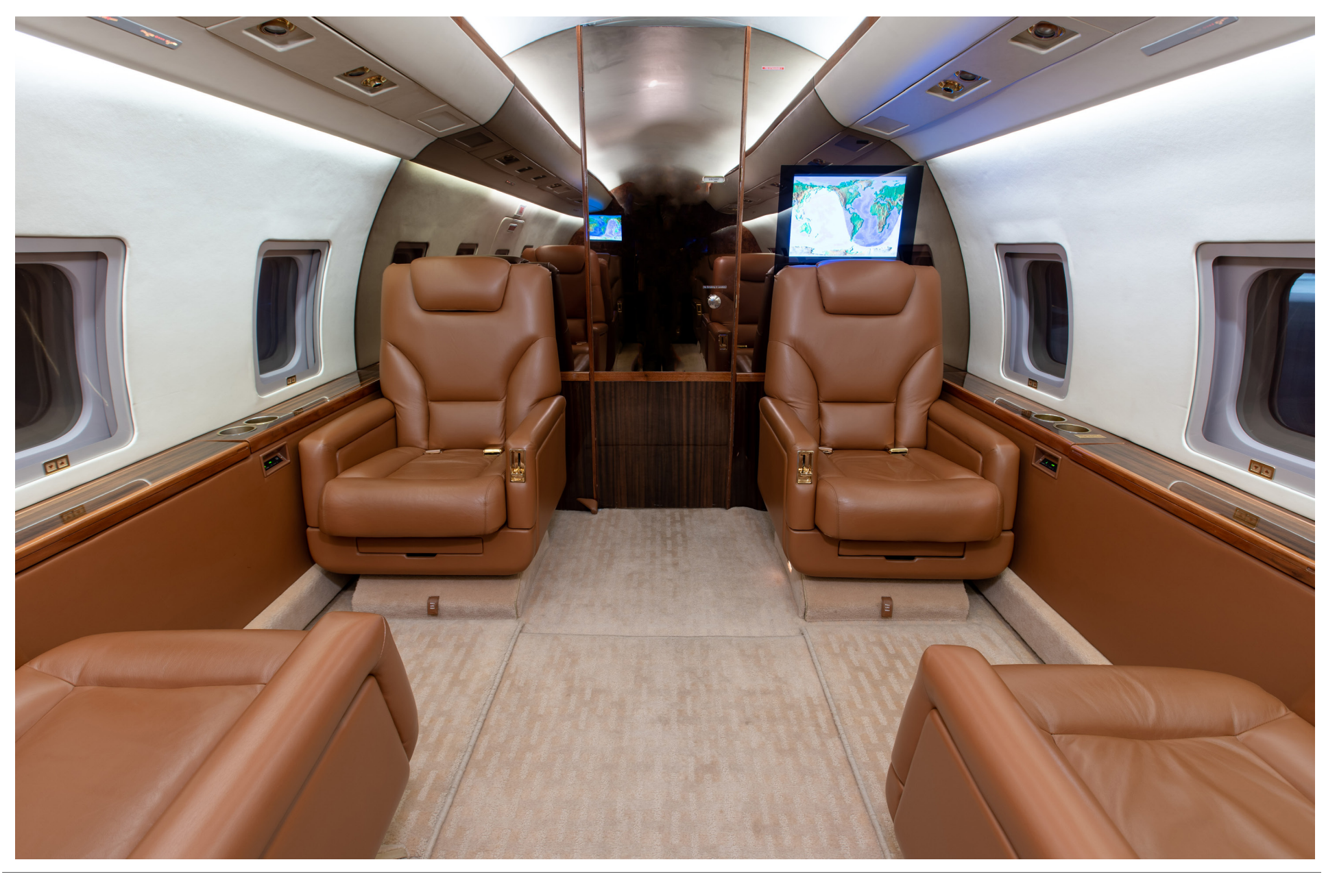
SPECIFICATIONS ARE PROVIDED FOR INFORMATIONAL PURPOSES ONLY AND DO NOT CONSTITUTE REPRESENTATIONS OR WARRANTIES. THESE SPECIFICATIONS ARE SUBJECT TO BUYER'S INDEPENDENT VERIFICATION UPON INSPECTION. THE AIRCRAFT IS SUBJECT TO PRIOR SALE, LEASE AND/OR REMOVAL FROM THE MARKET WITHOUT PRIOR NOTICE. MARCH 8, 2021 1:54 PM