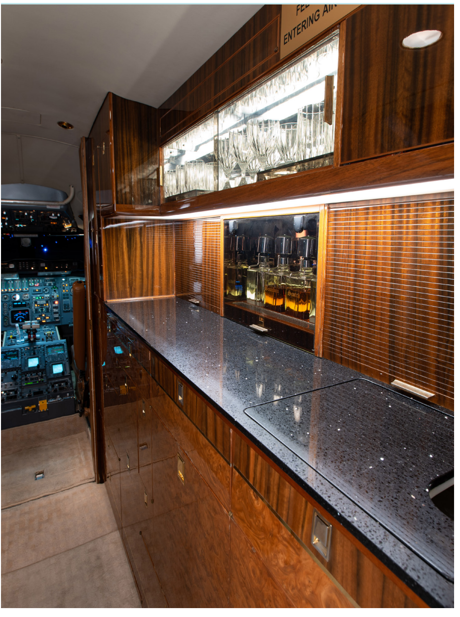
THE AIRCRAFT IS SUBJECT TO PRIOR SALE, LEASE AND/OR REMOVAL FROM THE MARKET WITHOUT PRIOR NOTICE. MARCH 8, 2021 1:54 PM