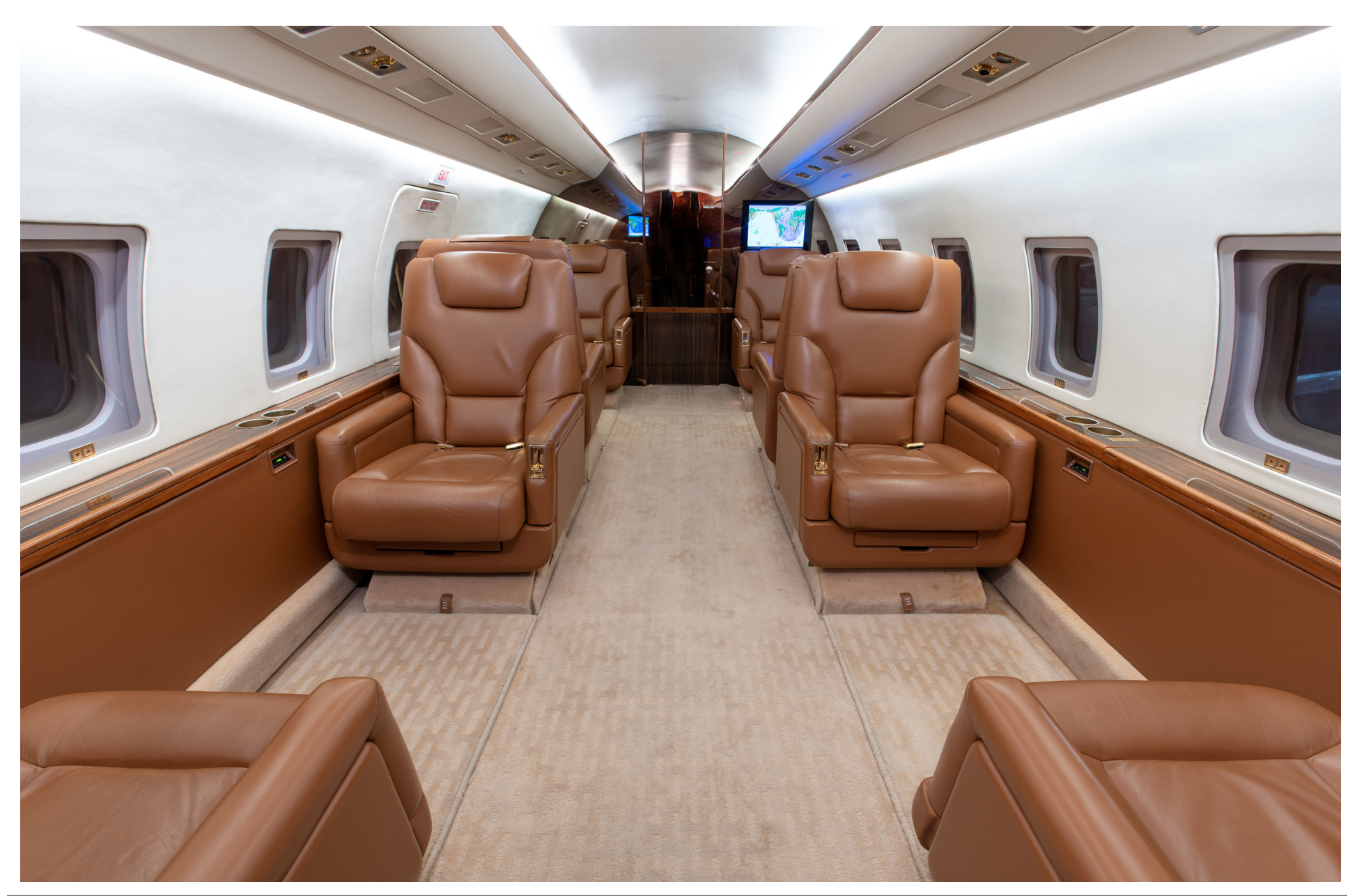
SPECIFICATIONS ARE PROVIDED FOR INFORMATIONAL PURPOSES ONLY AND DO NOT CONSTITUTE REPRESENTATIONS OR WARRANTIES. THESE SPECIFICATIONS ARE SUBJECT TO BUYER'S INDEPENDENT VERIFICATION UPON INSPECTION. THE AIRCRAFT IS SUBJECT TO PRIOR SALE, LEASE AND/OR REMOVAL FROM THE MARKET WITHOUT PRIOR NOTICE. MARCH 8, 2021 1:54 PM