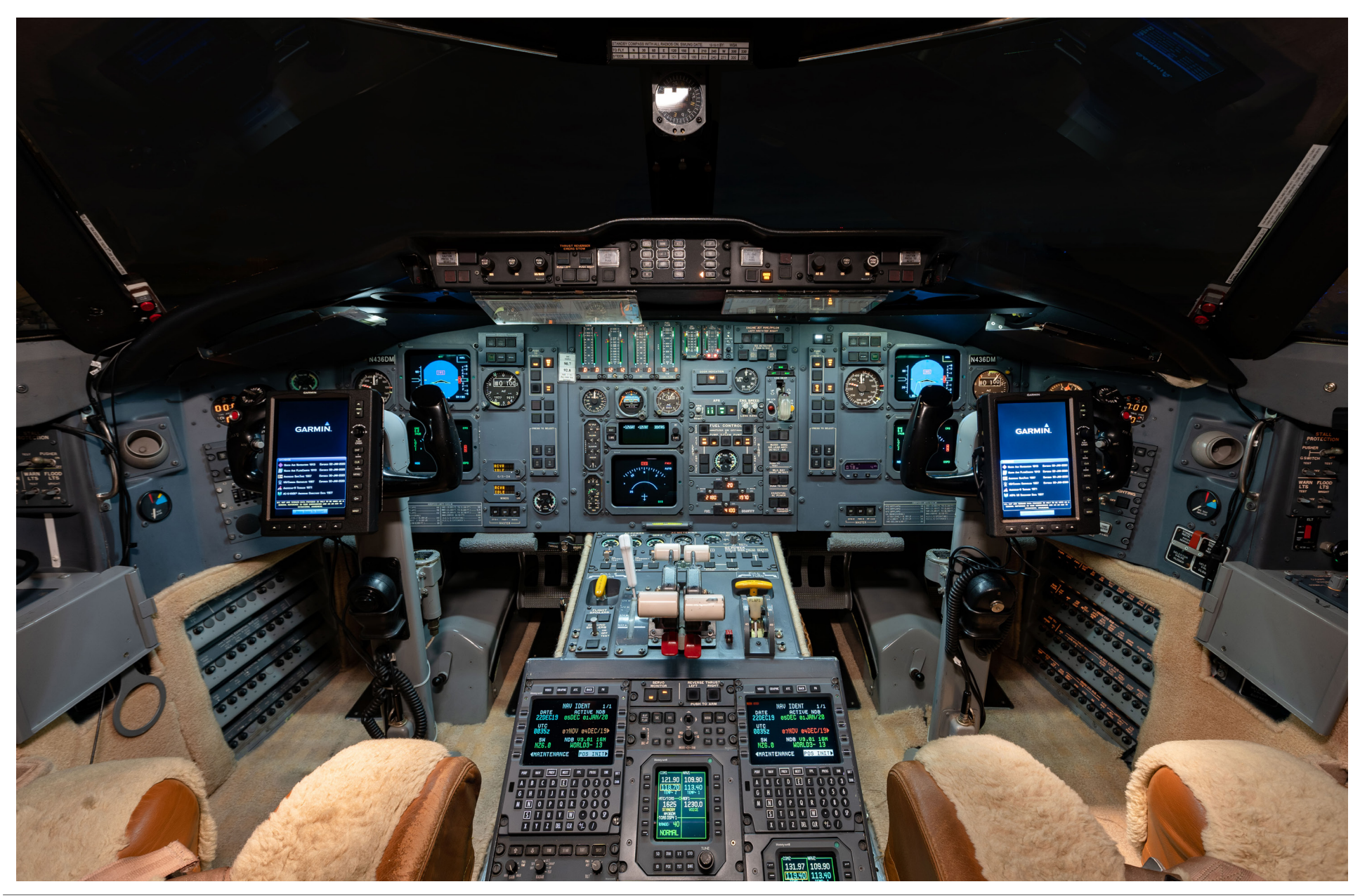
SPECIFICATIONS ARE PROVIDED FOR INFORMATIONAL PURPOSES ONLY AND DO NOT CONSTITUTE REPRESENTATIONS OR WARRANTIES. THESE SPECIFICATIONS ARE SUBJECT TO BUYER'S INDEPENDENT VERIFICATION UPON INSPECTION. THE AIRCRAFT IS SUBJECT TO PRIOR SALE, LEASE AND/OR REMOVAL FROM THE MARKET WITHOUT PRIOR NOTICE. MARCH 8, 2021 1:54 PM