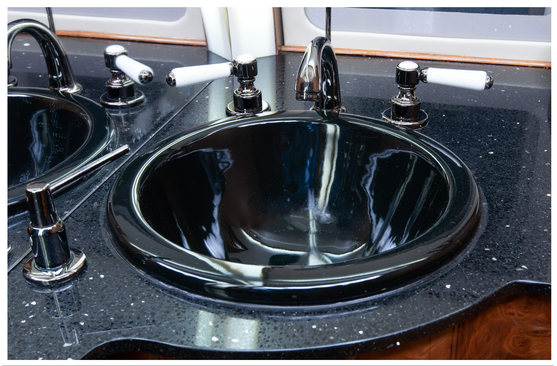
SPECIFICATIONS ARE PROVIDED FOR INFORMATIONAL PURPOSES ONLY AND DO NOT CONSTITUTE REPRESENTATIONS OR WARRANTIES. THESE SPECIFICATIONS ARE SUBJECT TO BUYER'S INDEPENDENT VERIFICATION UPON INSPECTION THE AIRCRAFT IS SUBJECT TO PRIOR SALE, LEASE AND/OR REMOVAL FROM THE MARKET WITHOUT PRIOR NOTICE. MARCH 8, 2021 1:54 PM