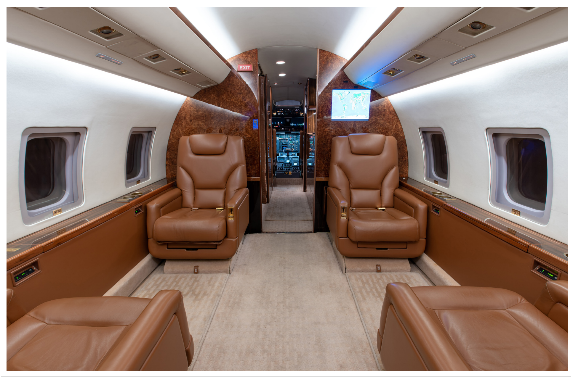
SPECIFICATIONS ARE PROVIDED FOR INFORMATIONAL PURPOSES ONLY AND DO NOT CONSTITUTE REPRESENTATIONS OR WARRANTIES. THESE SPECIFICATIONS ARE SUBJECT TO BUYER'S INDEPENDENT VERIFICATION UPON INSPECTION. THE AIRCRAFT IS SUBJECT TO PRIOR SALE, LEASE AND/OR REMOVAL FROM THE MARKET WITHOUT PRIOR NOTICE. MARCH 8, 2021 1:54 PM