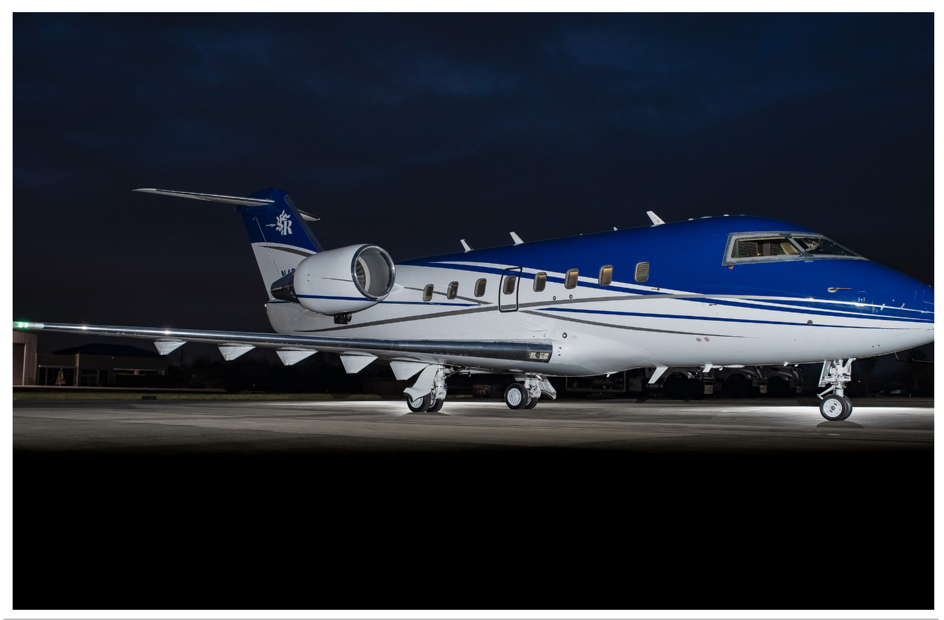
SPECIFICATIONS ARE PROVIDED FOR INFORMATIONAL PURPOSES ONLY AND DO NOT CONSTITUTE REPRESENTATIONS OR WARRANTIES. THESE SPECIFICATIONS ARE SUBJECT TO BUYER'S INDEPENDENT VERIFICATION UPON INSPECTION. THE AIRCRAFT IS SUBJECT TO PRIOR SALE, LEASE AND/OR REMOVAL FROM THE MARKET WITHOUT PRIOR NOTICE. MARCH 8, 2021 1:54 PM