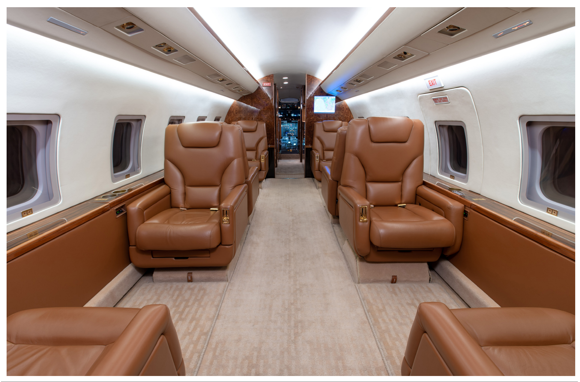
SPECIFICATIONS ARE PROVIDED FOR INFORMATIONAL PURPOSES ONLY AND DO NOT CONSTITUTE REPRESENTATIONS OR WARRANTIES. THESE SPECIFICATIONS ARE SUBJECT TO BUYER'S INDEPENDENT VERIFICATION UPON INSPECTION. THE AIRCRAFT IS SUBJECT TO PRIOR SALE, LEASE AND/OR REMOVAL FROM THE MARKET WITHOUT PRIOR NOTICE. MARCH 8, 2021 1:54 PM