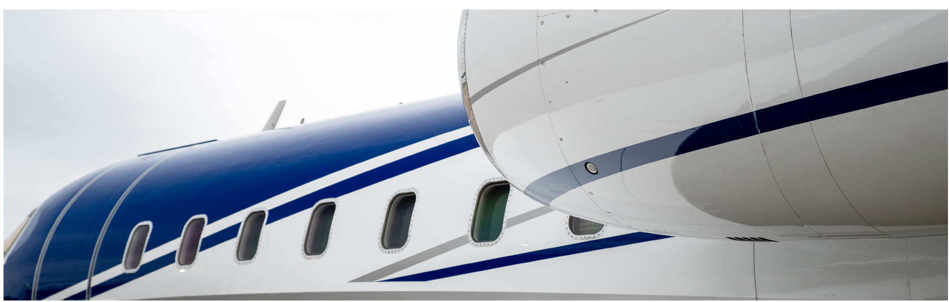
SPECIFICATIONS ARE PROVIDED FOR INFORMATIONAL PURPOSES ONLY AND DO NOT CONSTITUTE REPRESENTATIONS OR WARRANTIES. THESE SPECIFICATIONS ARE SUBJECT TO BUYER'S INDEPENDENT VERIFICATION UPON INSPECTION THE AIRCRAFT IS SUBJECT TO PRIOR SALE, LEASE AND/OR REMOVAL FROM THE MARKET WITHOUT PRIOR NOTICE. MARCH 8, 2021 1:54 PM