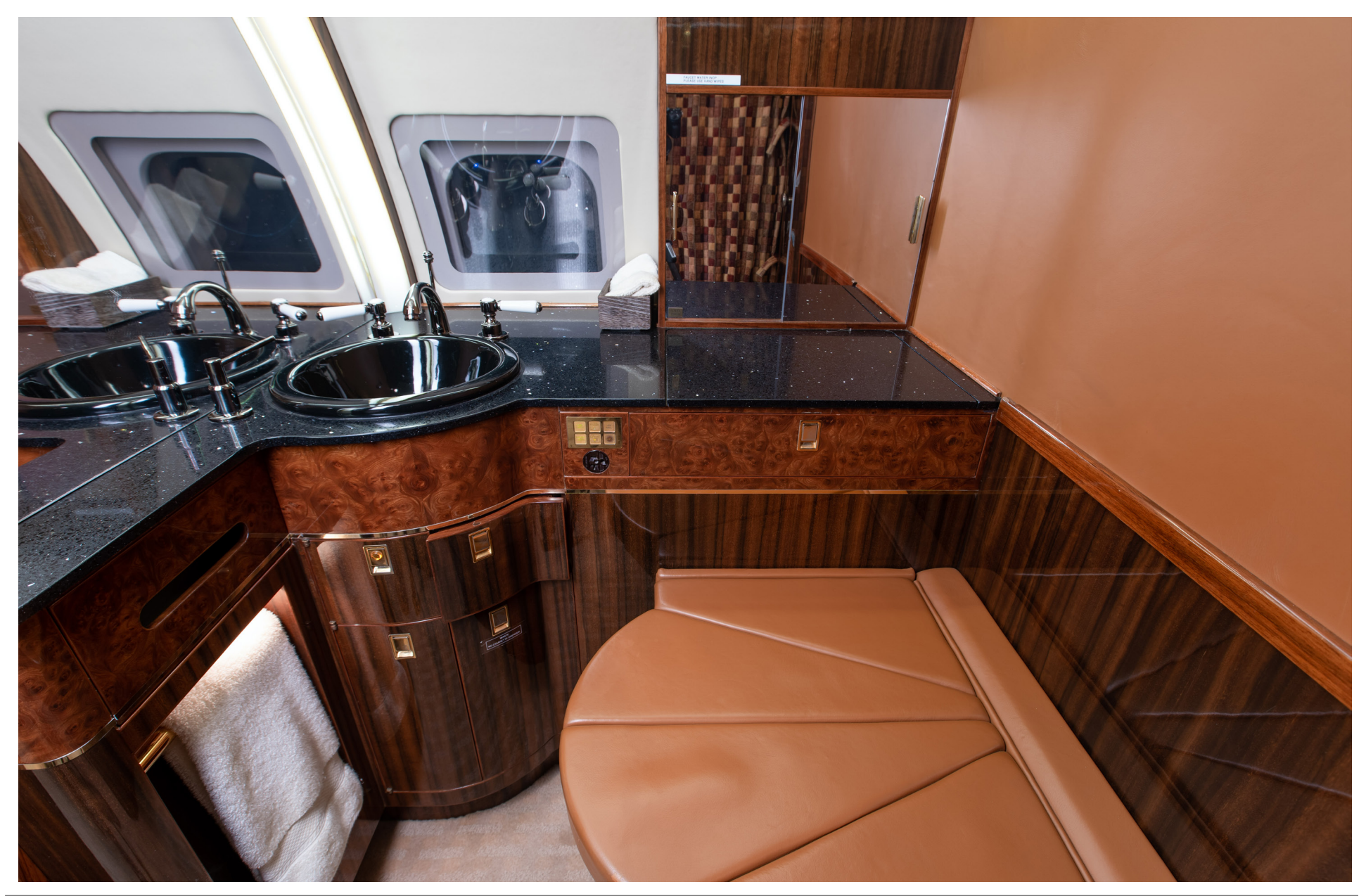
SPECIFICATIONS ARE PROVIDED FOR INFORMATIONAL PURPOSES ONLY AND DO NOT CONSTITUTE REPRESENTATIONS OR WARRANTIES. THESE SPECIFICATIONS ARE SUBJECT TO BUYER'S INDEPENDENT VERIFICATION UPON INSPECTION. THE AIRCRAFT IS SUBJECT TO PRIOR SALE, LEASE AND/OR REMOVAL FROM THE MARKET WITHOUT PRIOR NOTICE. MARCH 8, 2021 1:54 PM