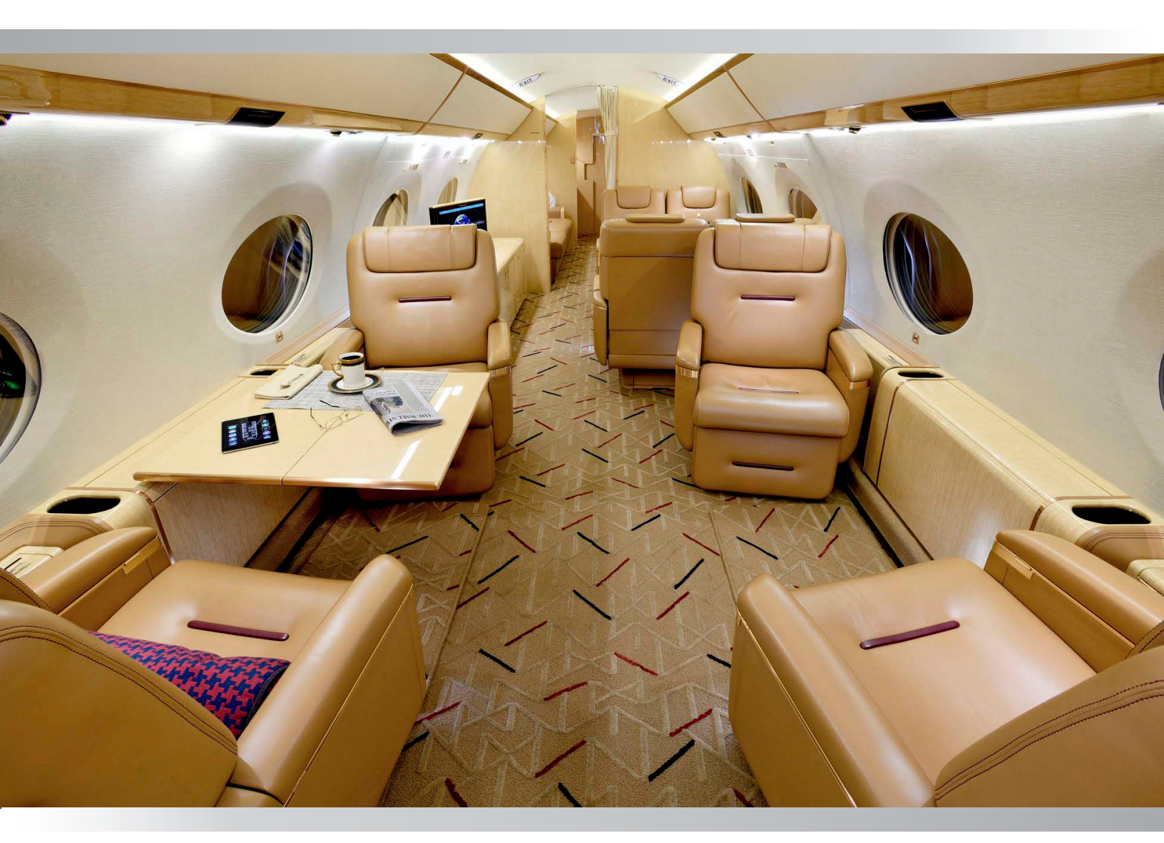
Forward cabin looking aft