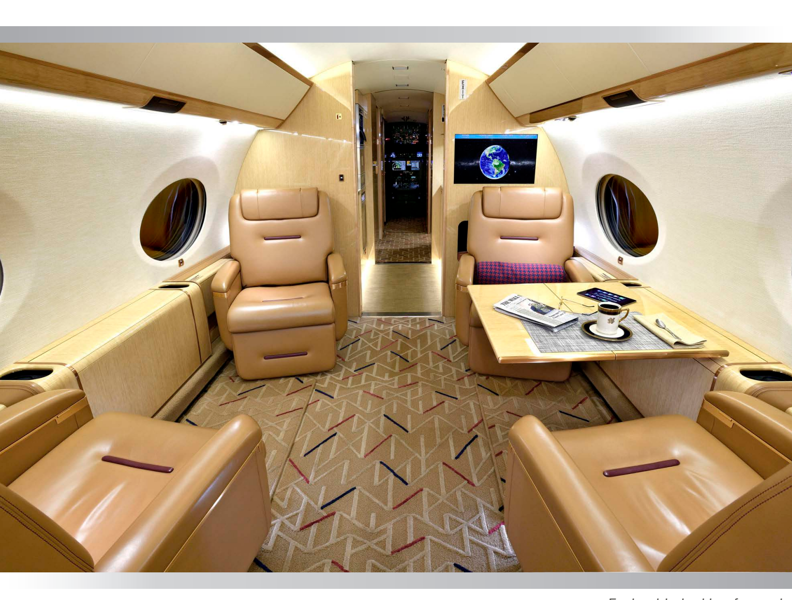
Fwd cabin looking forward