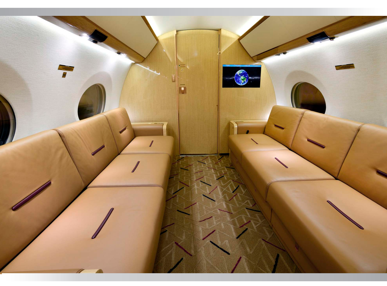
Aft cabin looking aft