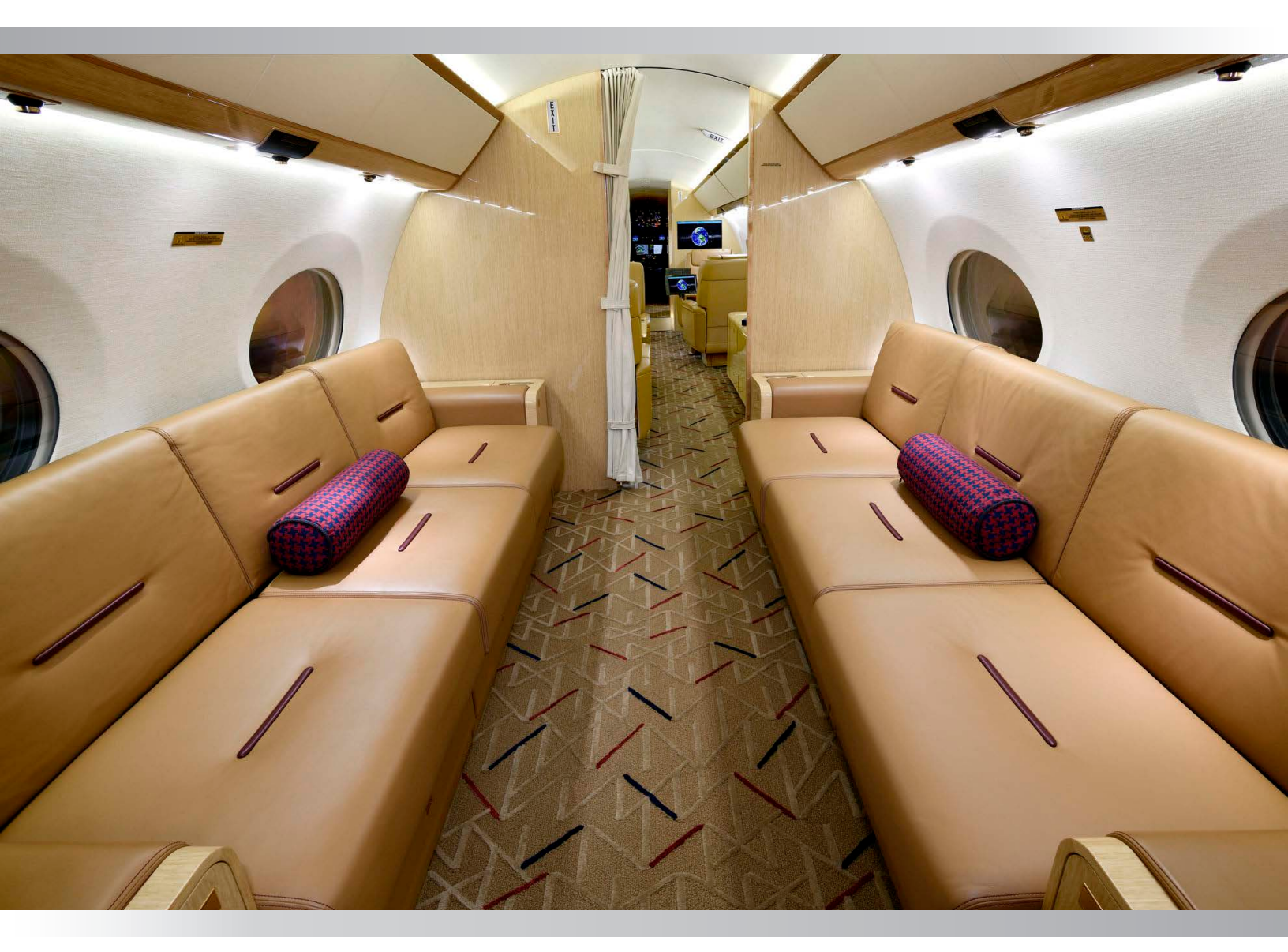
Aft cabin looking forward