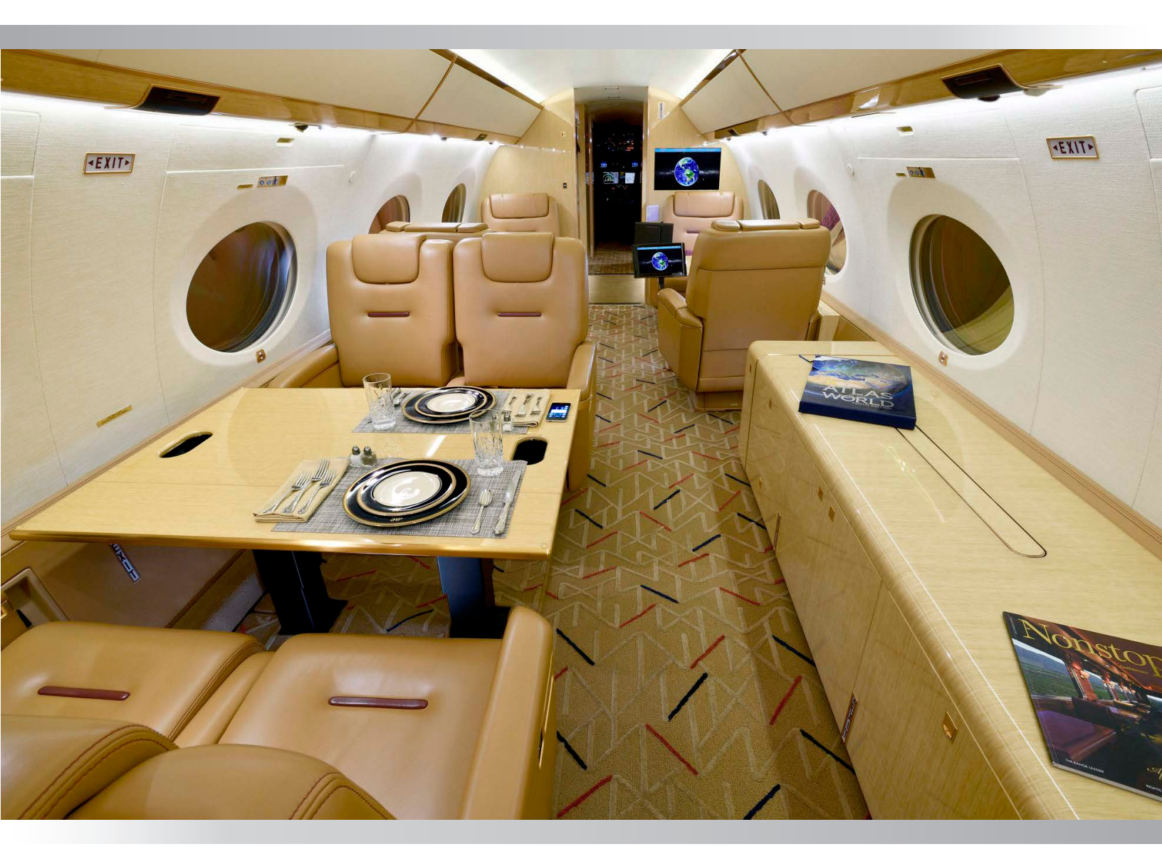
Mid cabin looking forward