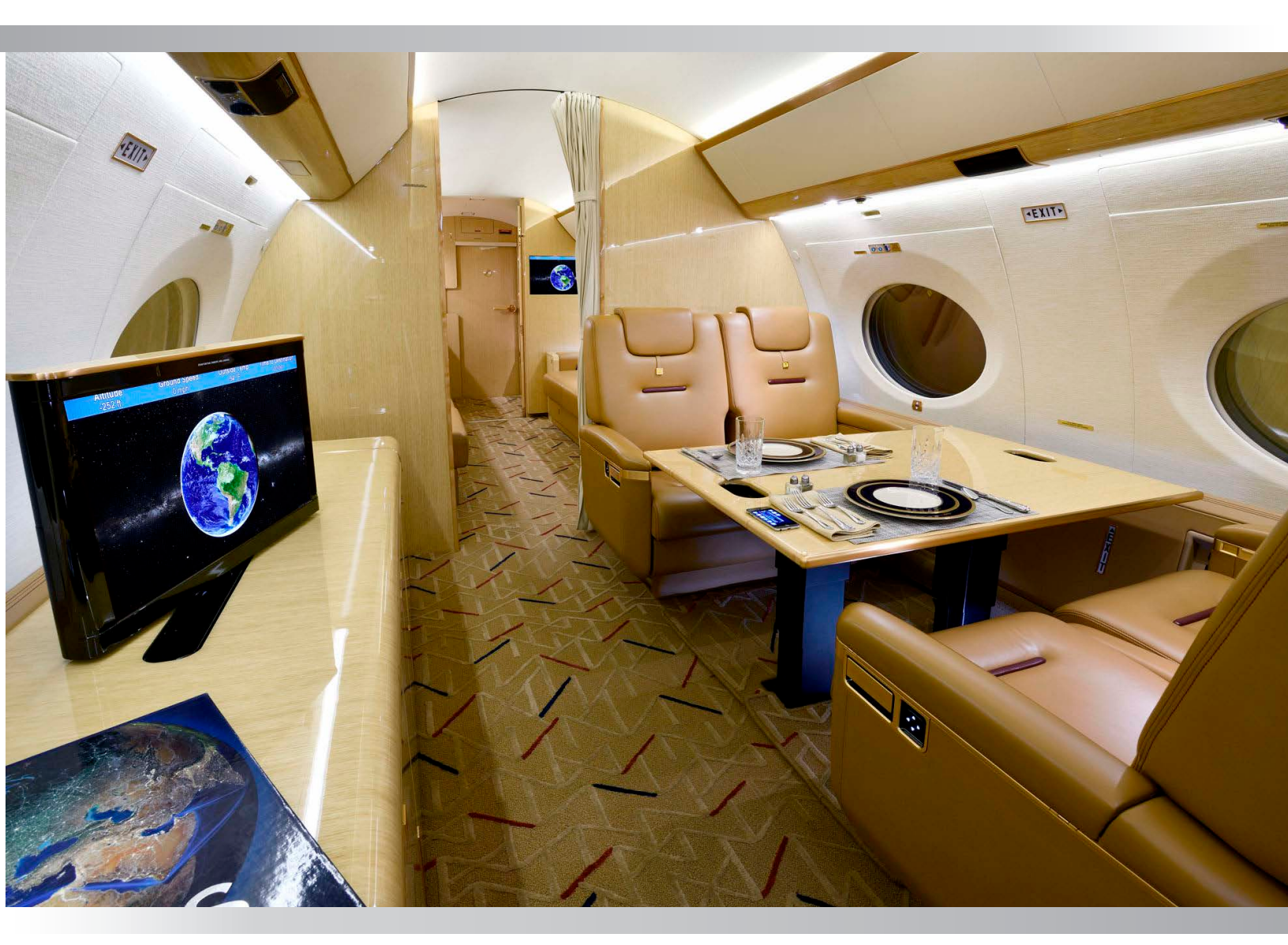
Mid cabin looking aft