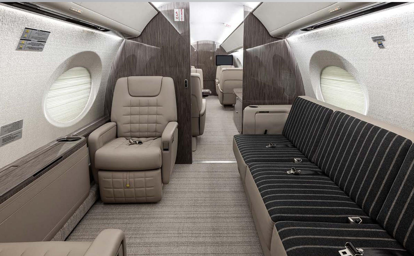
Aft looking forward