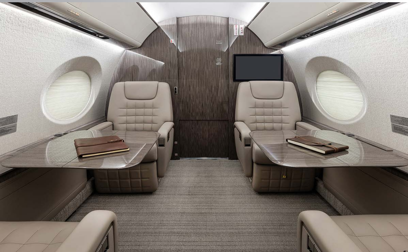
Forward looking forward