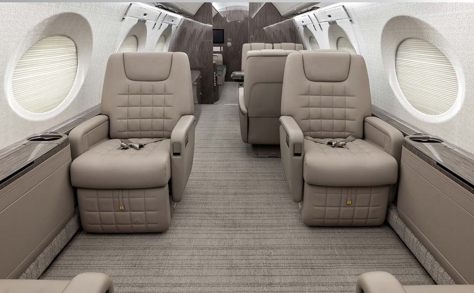
Forward looking aft