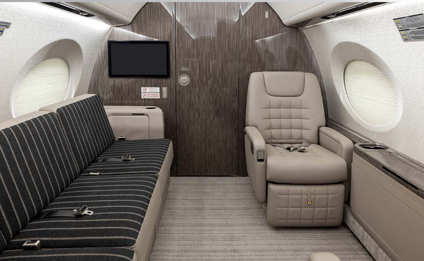
Aft looking aft