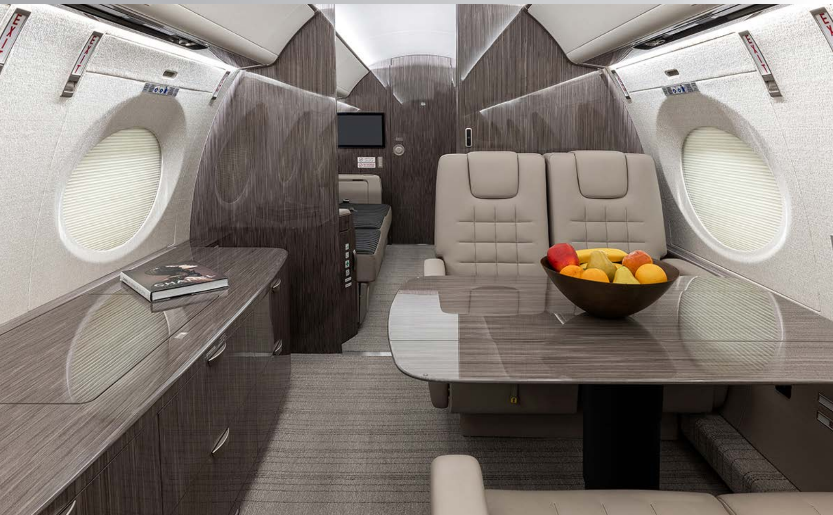
Mid looking aft