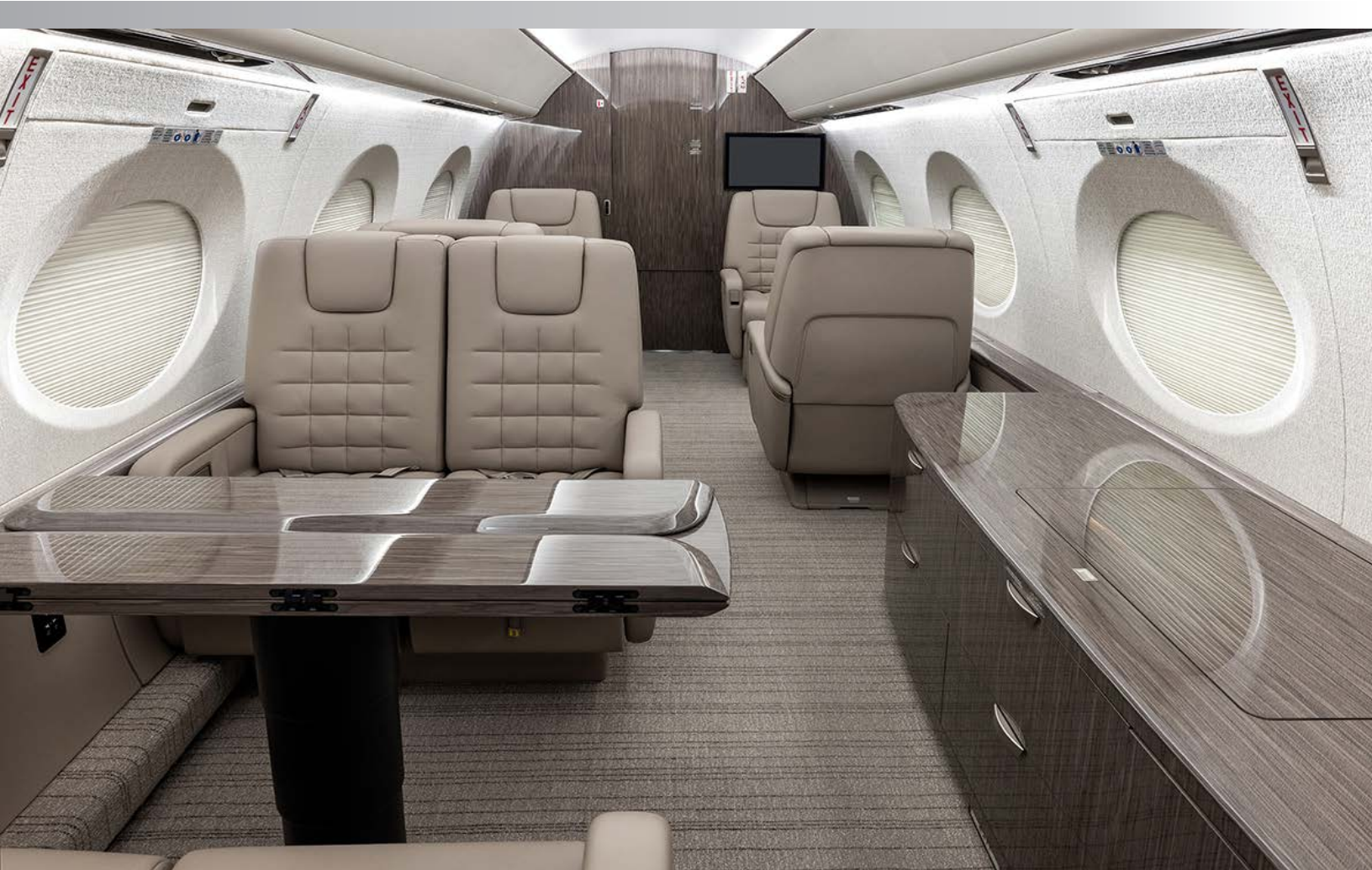
Mid looking forward