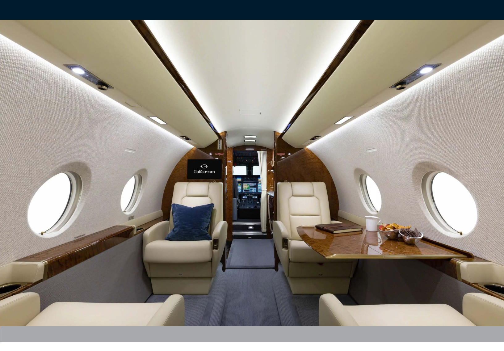
Forward cabin looking forward