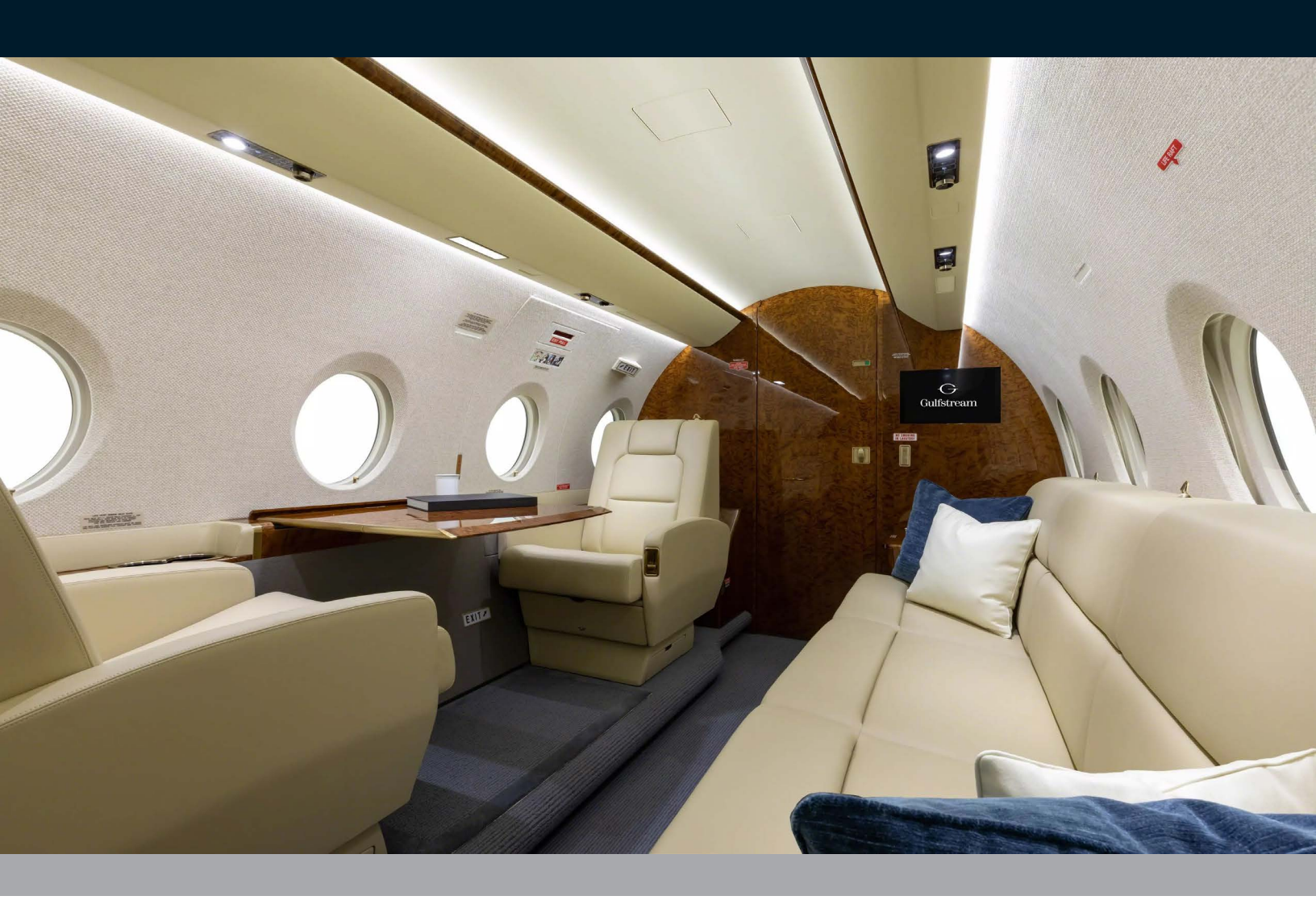
Aft cabin looking aft