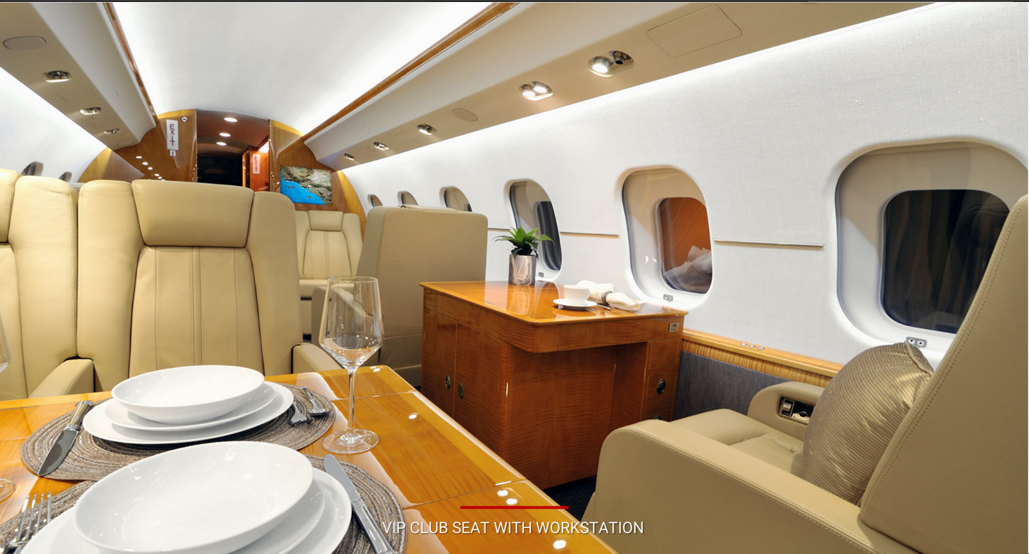
VIP CLUB SEAT WITH WORKSTATION

Contact Kevin White for further information | kwhite@jetedgepartners.com | +1 410 928 4022 | +1 850 501 8121 | www.jetedgepartners.com