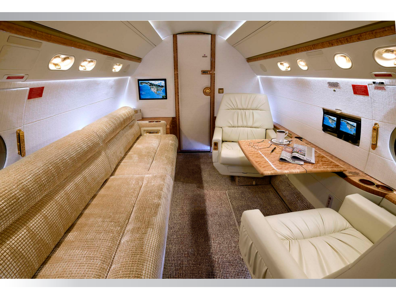
Aft cabin looking aft