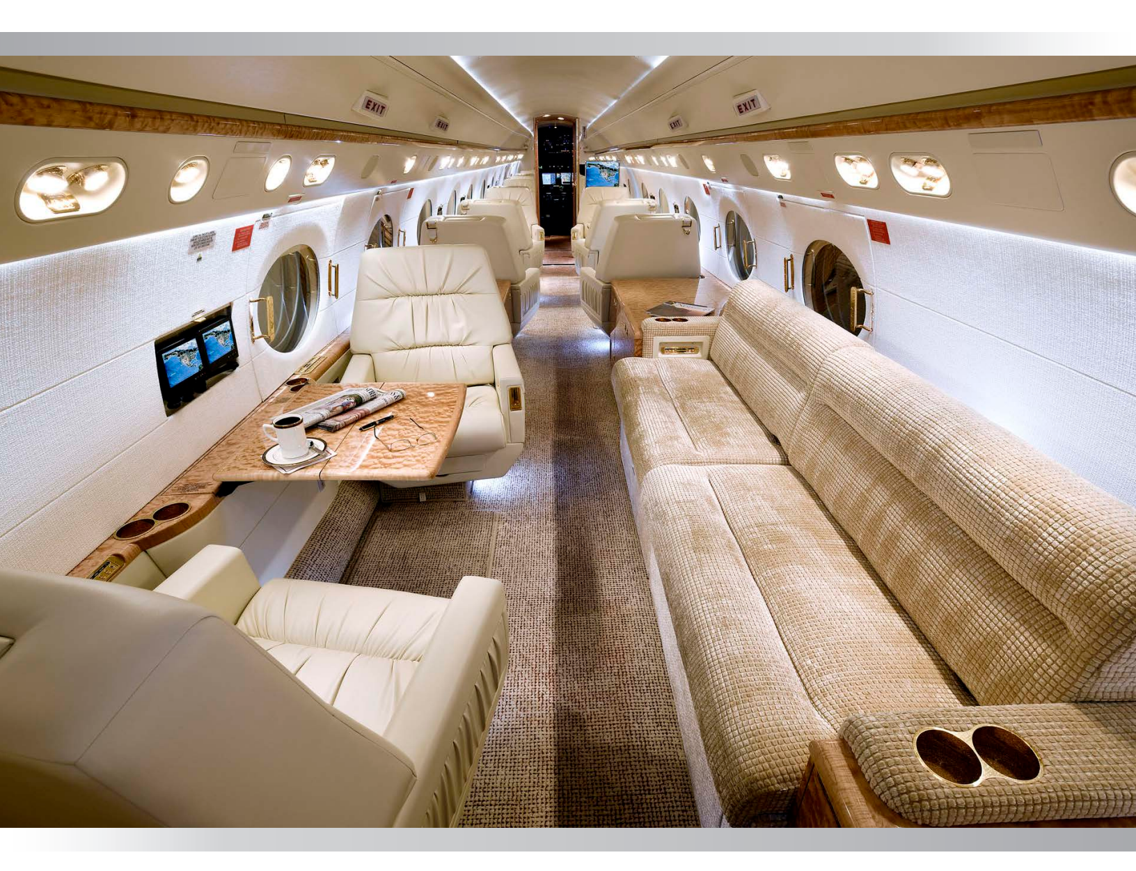
Aft cabin looking forward