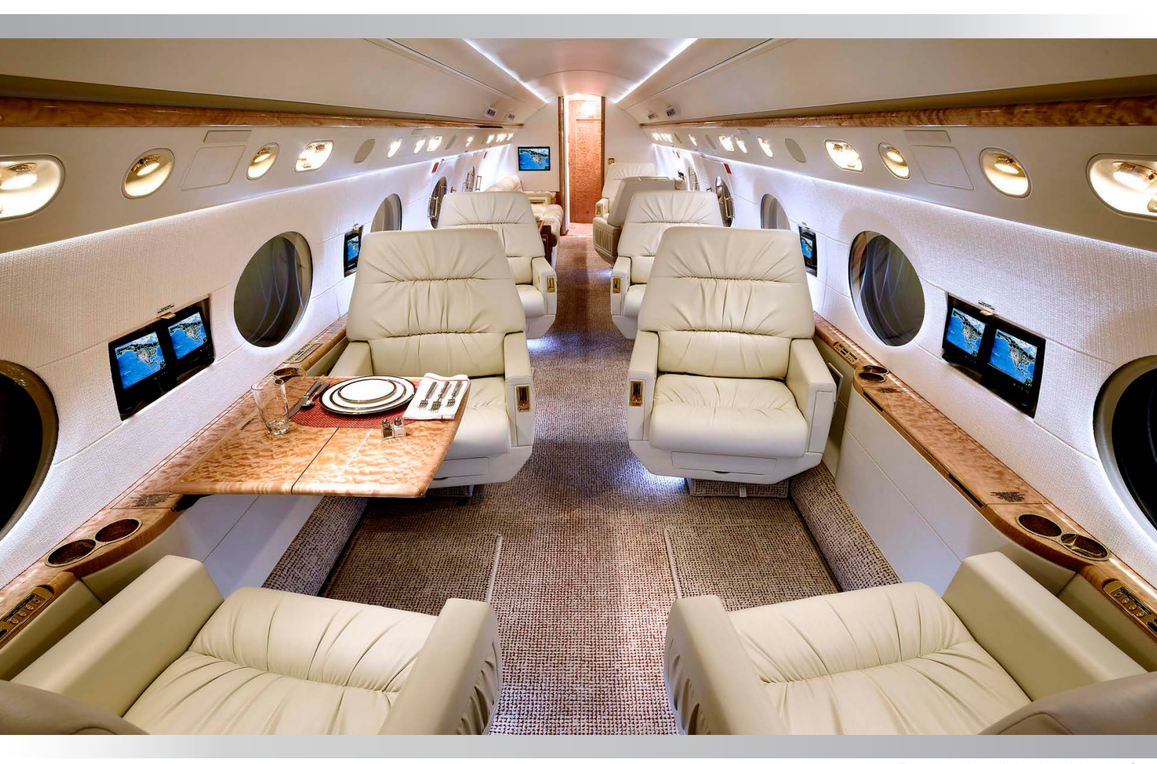
Forward cabin looking aft