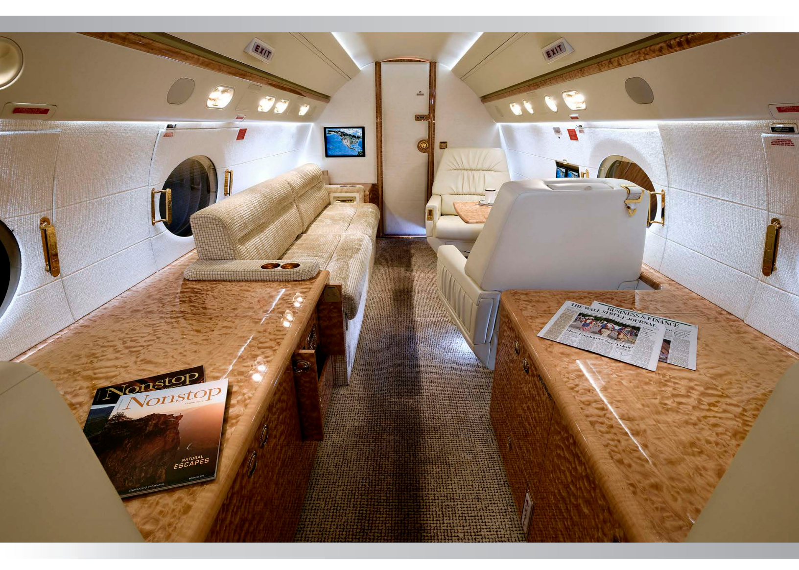
Mid cabin looking aft