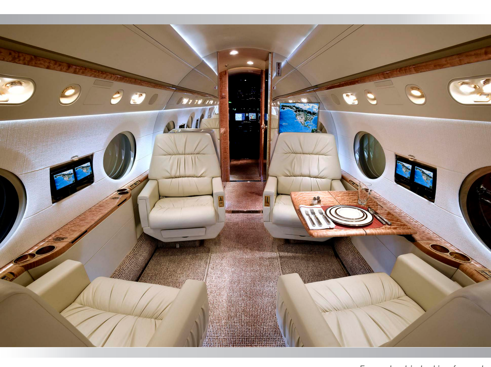
Forward cabin looking forward